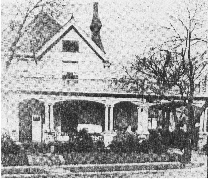
Remember When #1: 416 West 12th Street in 1942. Note the fancy chimney. This home was demolished in the

e-mail: info@adnahome.org website: www.adnahome.org