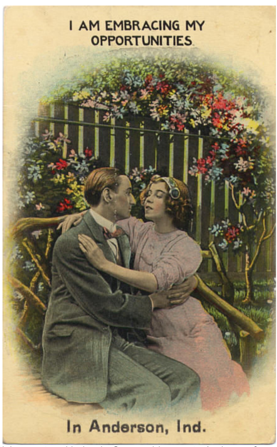
An enticing postcard indeed. One could come to Anderson for work and love in the early 1900s. Who knew?

link to make a one-time donation! Your dues support our monthly newsletter printing, website costs, and various neighborhood projects!!! Only $10.00 per year!!!