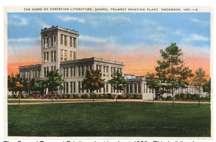
The Gospel Trumpet Printing plant in about 1920. This building has been gone for many years.