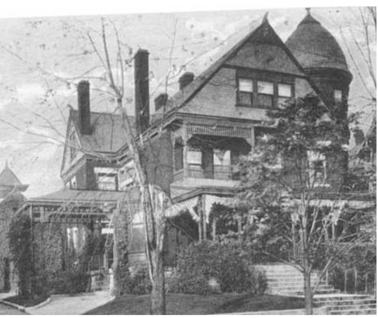
1011 Jackson Street in 1917.

and home was used as the Y.W.C.A. from about 1915 into the 1950s when the current building was built at West 11th chase St. The home sat just North of what is now the stial building at the corner of West 11th and Jackson St. It emolished in 1960 to make way for drive-up banking as (these are gone as well – the lot is used for parking now).